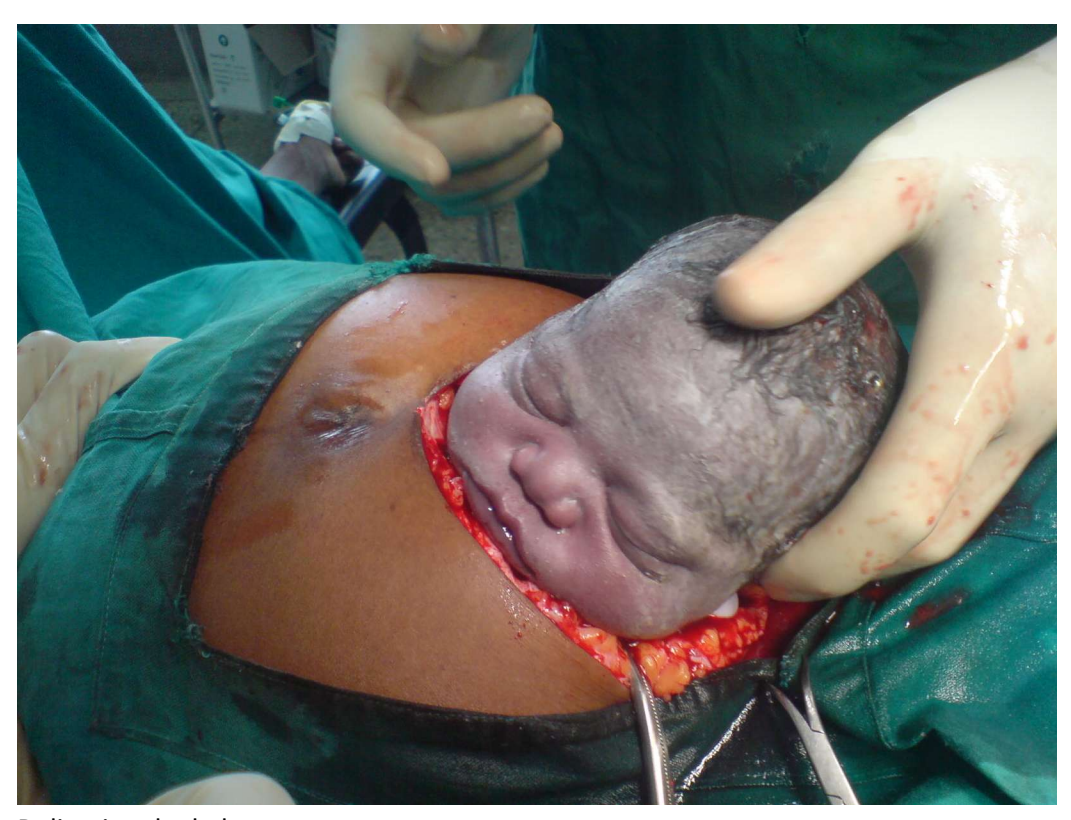
Delivering the baby