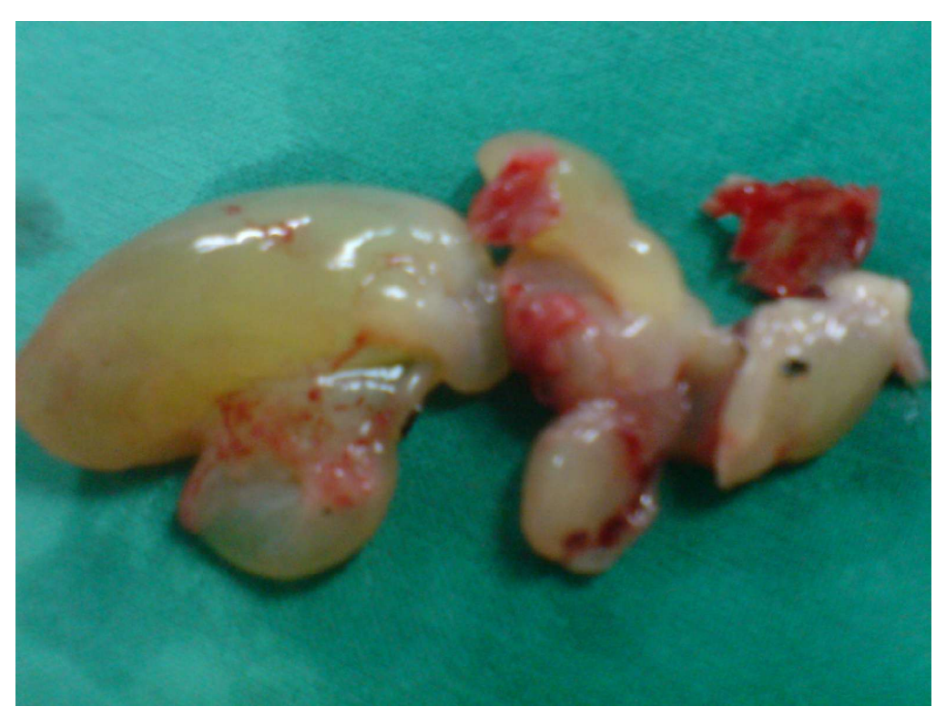
The polyp removed, it originated from the nose extending to the throat.