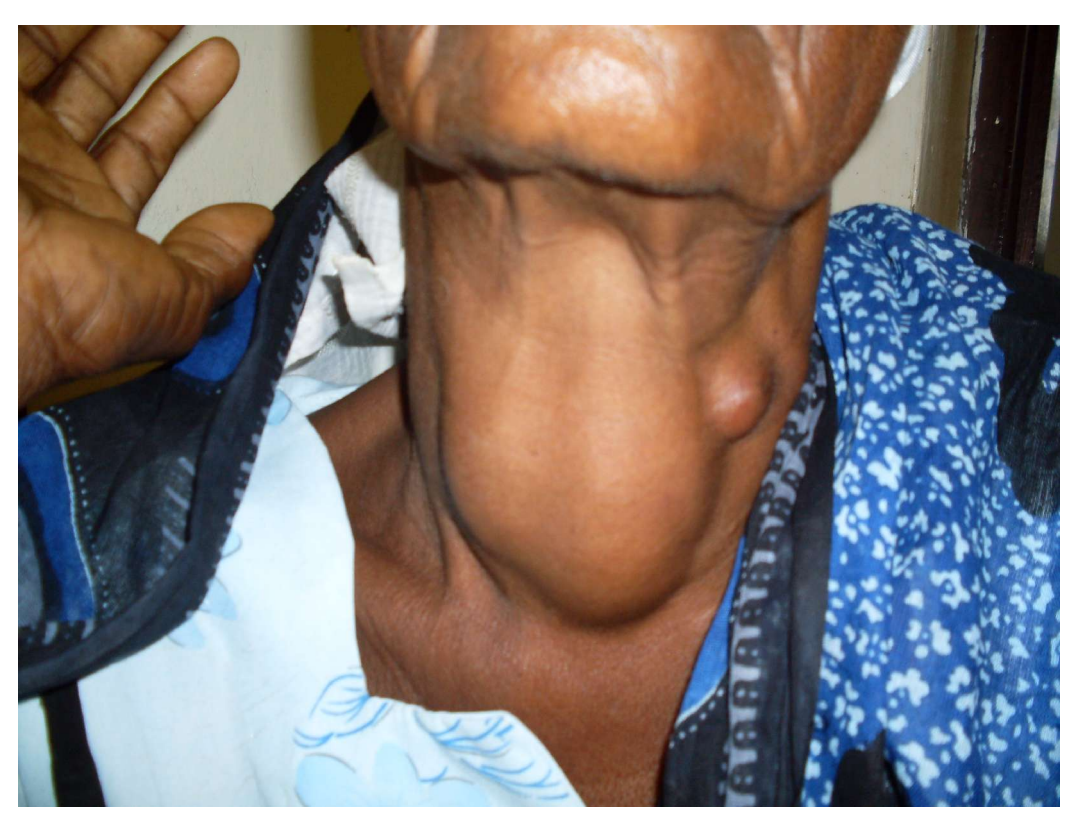
Goitre of 4 yrs