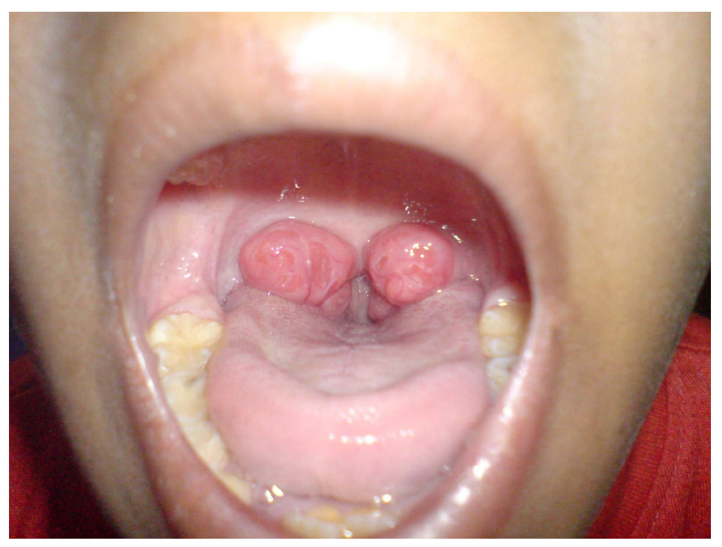
Child with hypertrophied tonsils causing difficult on feeding