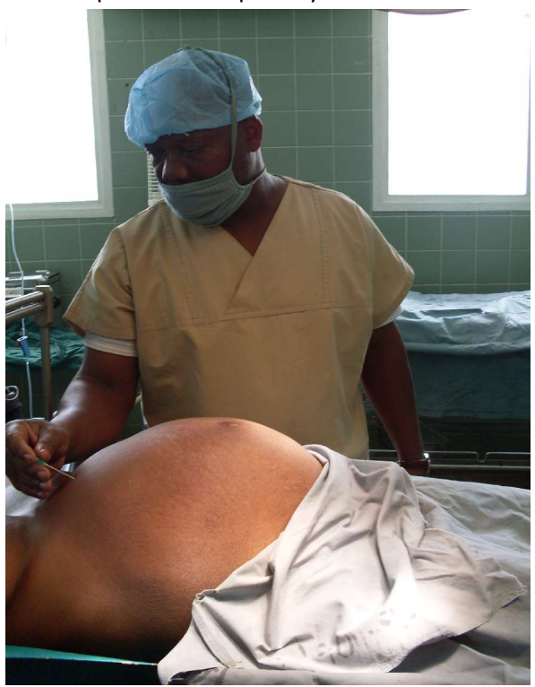
Dr kassim checking the spinal anaesthesia

The camp was interrupted by 2 caesarean sections,